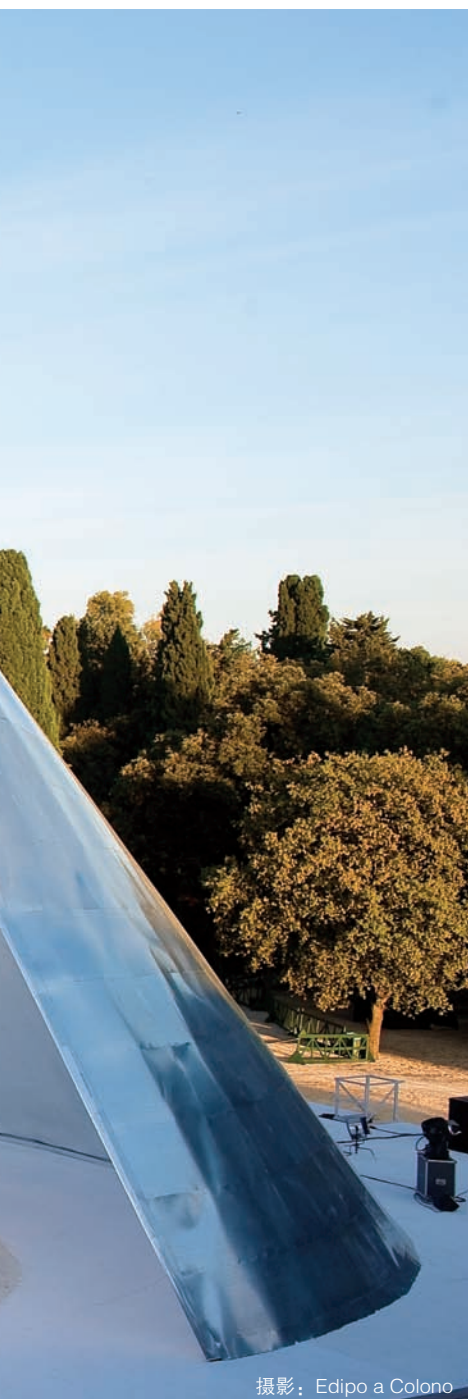
摄影：Edipo a Colono