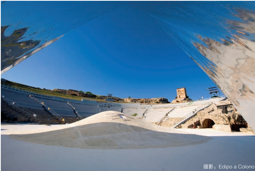
摄影: Edipo a Colono