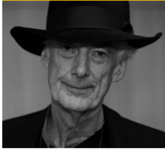
UAL Campus for Central Saint Martins / UK / Stanton Williams / Speaking at WAF

We know what architects do, but what are the ideas that underpin activity? The leading critic and landscape designer reviews the shifting history of architectural values. Charles Jencks , Architectural Theorist, Landscape Architect and Designer