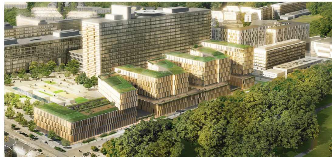
Rigshospitalet – The North Wing / Denmark / 3XN / Speaking at WAF

See worldarchitecturefestival.com for speaker updates